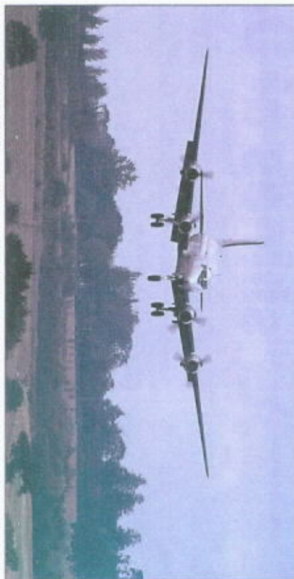
ABOVE DC-4 N31356 arriving at North Weald on September 28. In the Berlin Airlift film it will portray a coal-hauler. LEFT The DC-4 (left) and C-54Q N44914 side-by-side on the Aces High ramp on September 29.

Halvorsen, who became a legend among Berliners for parachuting packets of sweets to the children of the city during the Airlift. Part of the shooting schedule will see the Douglas fleet flying from an airfield in Hungary for many of the "German" scenes in the film.